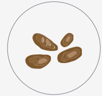
Type 5: Lacking fiber Soft blobs with clear-cut edges