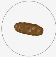
Type 3: Normal A sausage shape with cracks in the surface