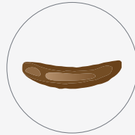
Type 4: Normal Like a smooth, soft sausage or snake