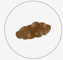
Type 2: Mild constipation Lumpy and sausage-like