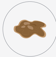
Type 7: Severe diarrhea Liquid consistency with no solid pieces