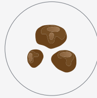
Type 1: Severe constipation Separate hard lumps